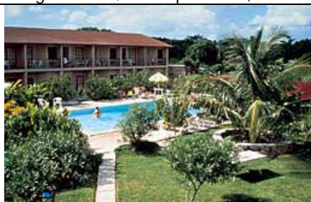
Orange Hill Beach Inn

Optional surcharge for MAP at Coral Sands and Club Peace & Plenty (excluding Orange Hill) is $186.00 per adult for 4 nights and $90.00 per child, for 4 nights.