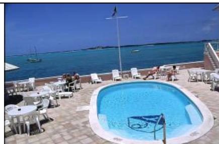
Club Peace &amp; Plenty